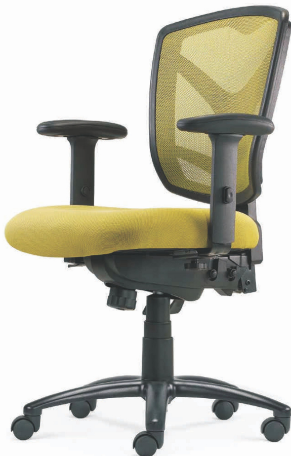
Mid-back swivel chair with PU adjustable Armrest & die-cast aluminium base 628 TQ A63 BB