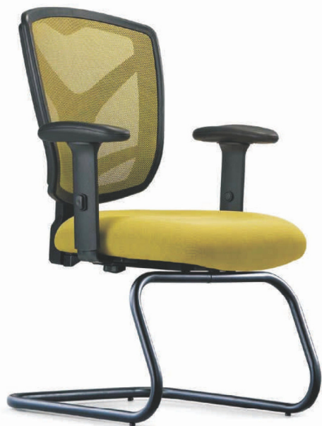
Visitor chair with PU adjustable Armrest 621 NA A63 B4

A multi-functional office chair designed for users who remain seated for extended hours, such as in call centres, service counter and control rooms. The BIFMA Standard Asynchro mechanism system provide a full range of support for our body throughout a whole day's work. A breathable polyester mesh suspension allow improved ventilation and transpiration, to provide exceptional thermal comfort. Monti can be tailored into different versions to suite specific needs by combining different mechanism, armrest and base options.