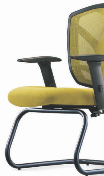
Visitor chair with PP adjustable Armrest 621 NA A4S B4