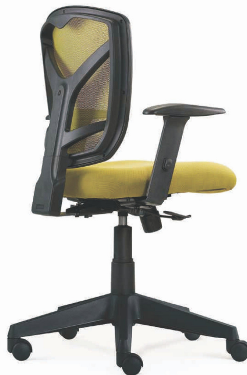
Mid-back swivel chair with PP adjustable Armrest & plastic base 628 YG A4S N3